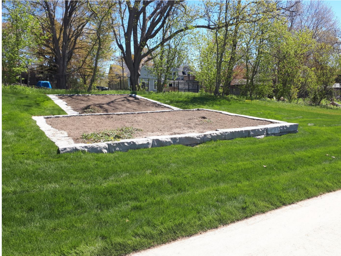
Celebrating the Past – Stone and Garden Display of the Foundation of David Willson House