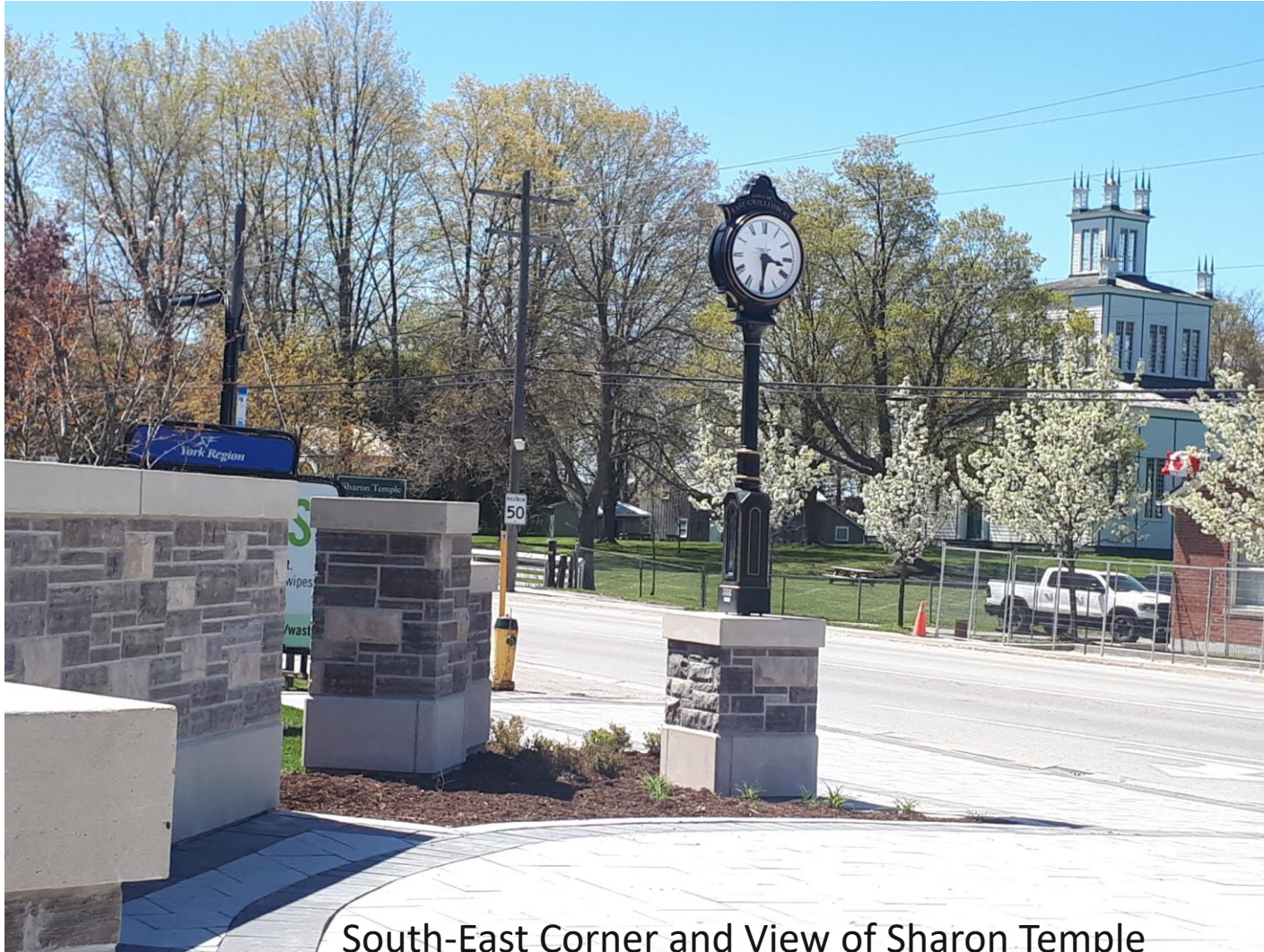
South-East Corner and View of Sharon Temple