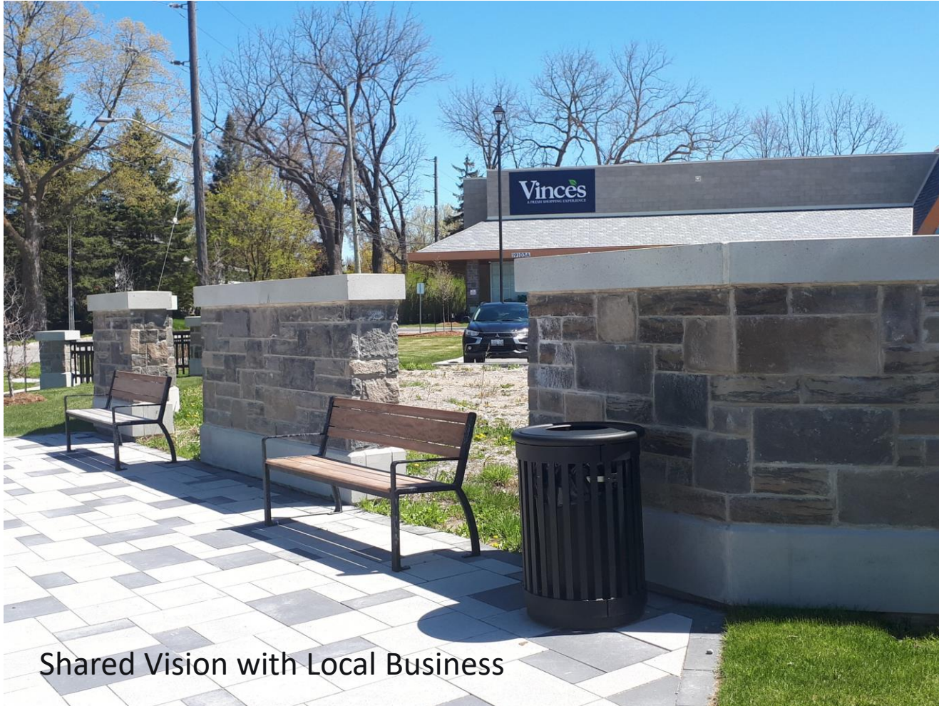
Shared Vision with Local Business