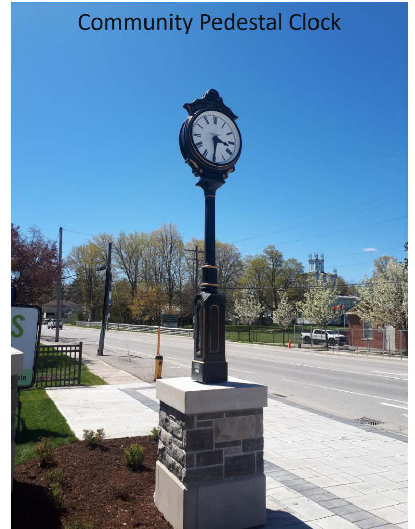
Community Pedestal Clock