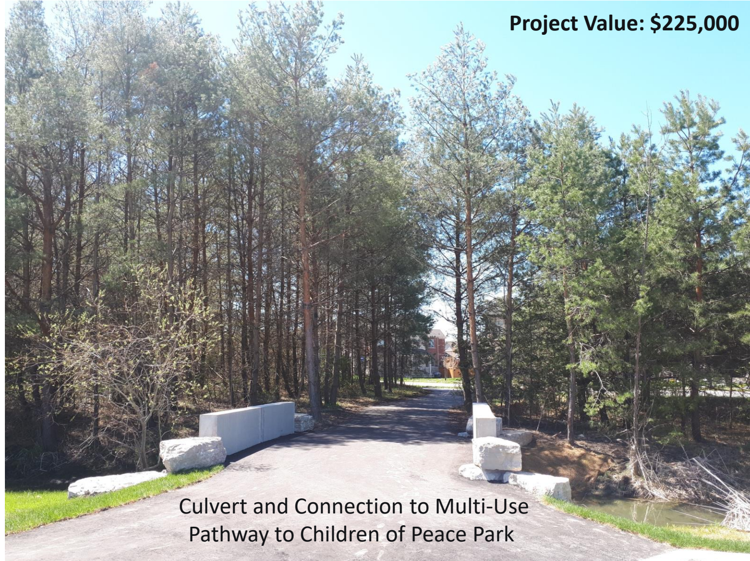
Culvert and Connection to Multi-Use Pathway to Children of Peace Park