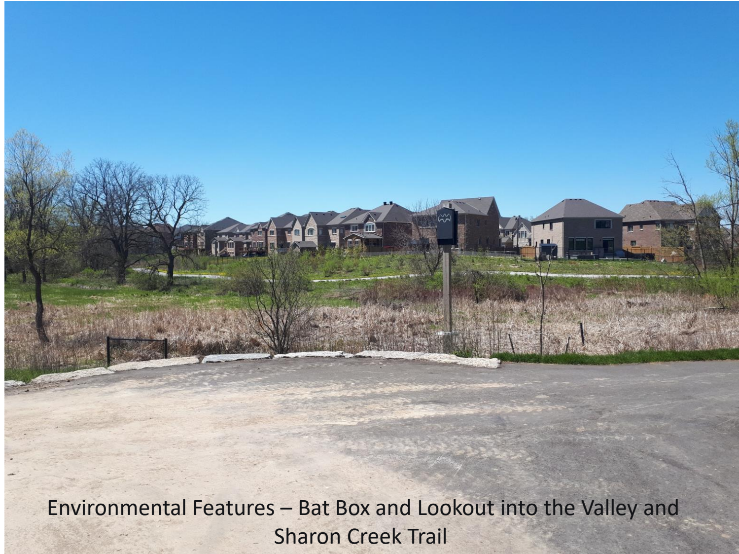
Environmental Features – Bat Box and Lookout into the Valley and Sharon Creek Trail