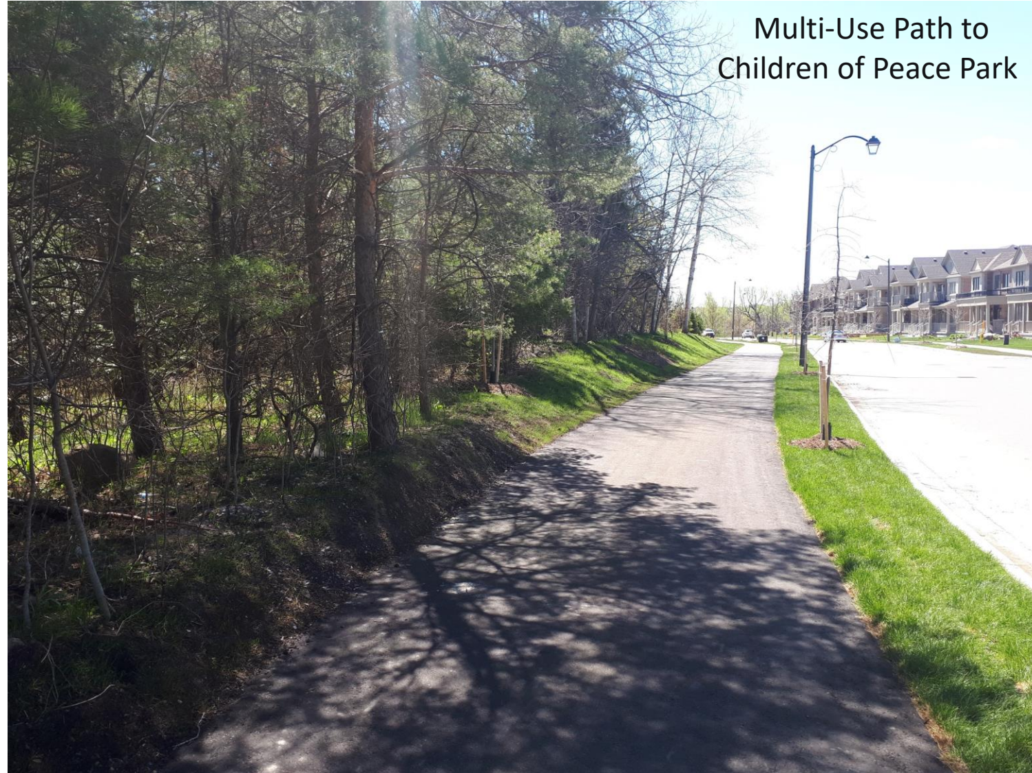
Multi-Use Path to Children of Peace Park