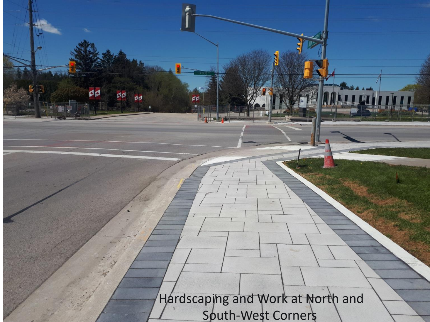
Hardscaping and Work at North and South-West Corners