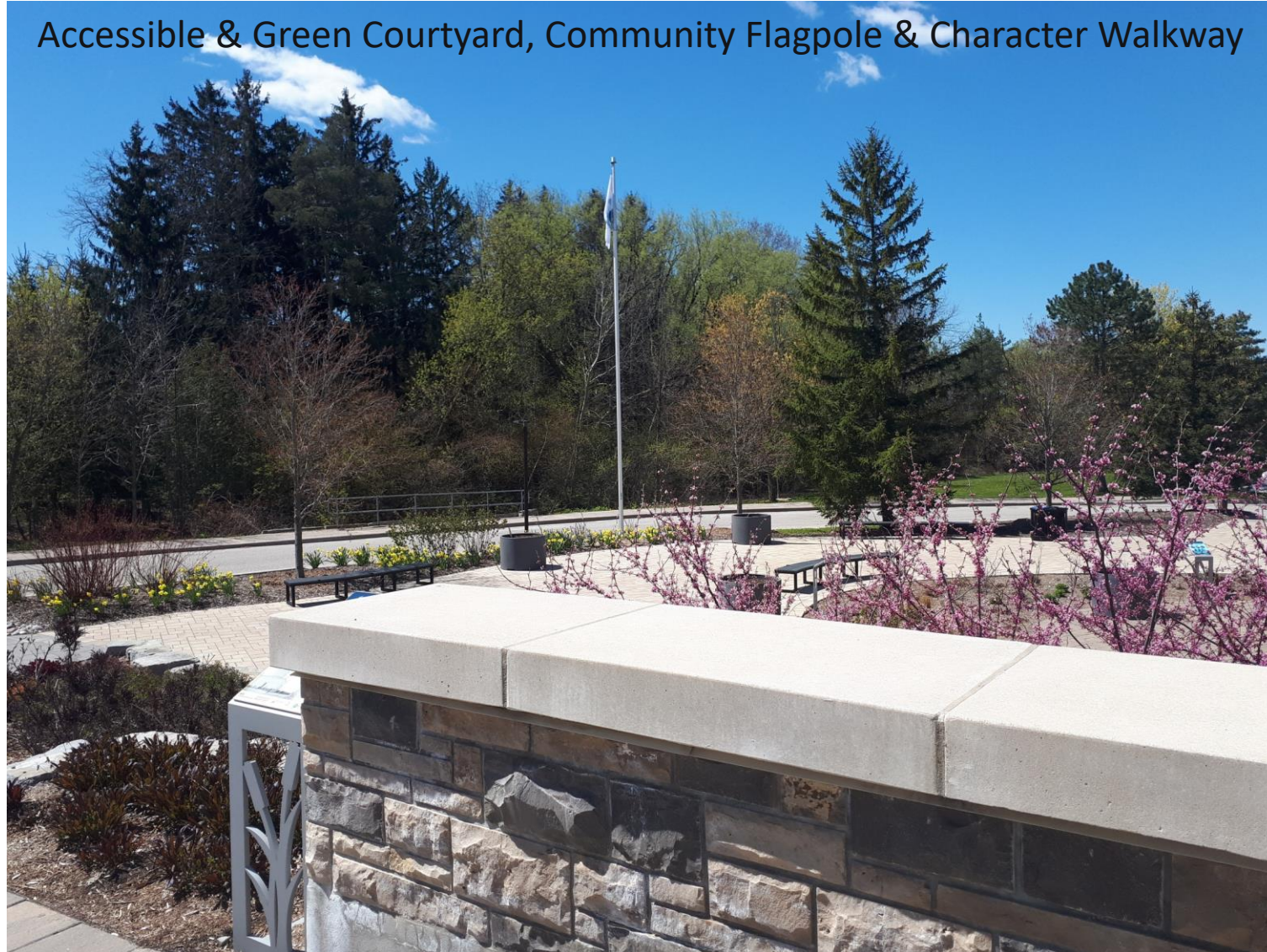
Accessible & Green Courtyard, Community Flagpole & Character Walkway