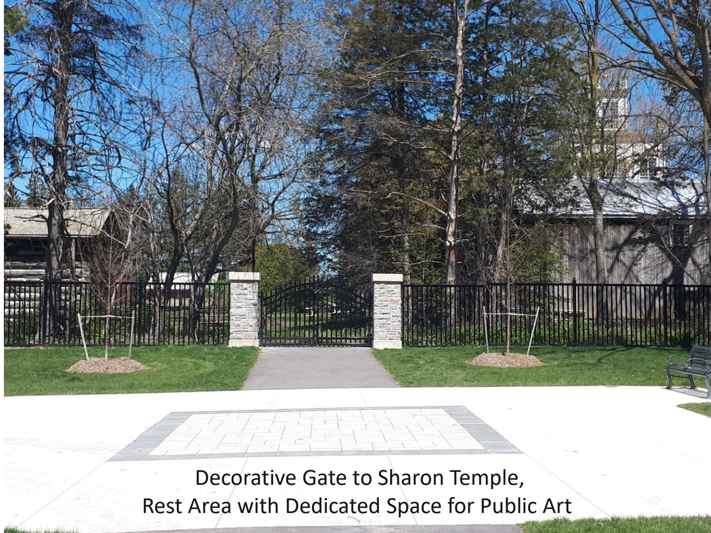
Decorative Gate to Sharon Temple, Rest Area with Dedicated Space for Public Art