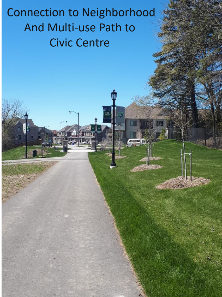
Connection to Neighborhood And Multi-use Path to Civic Centre