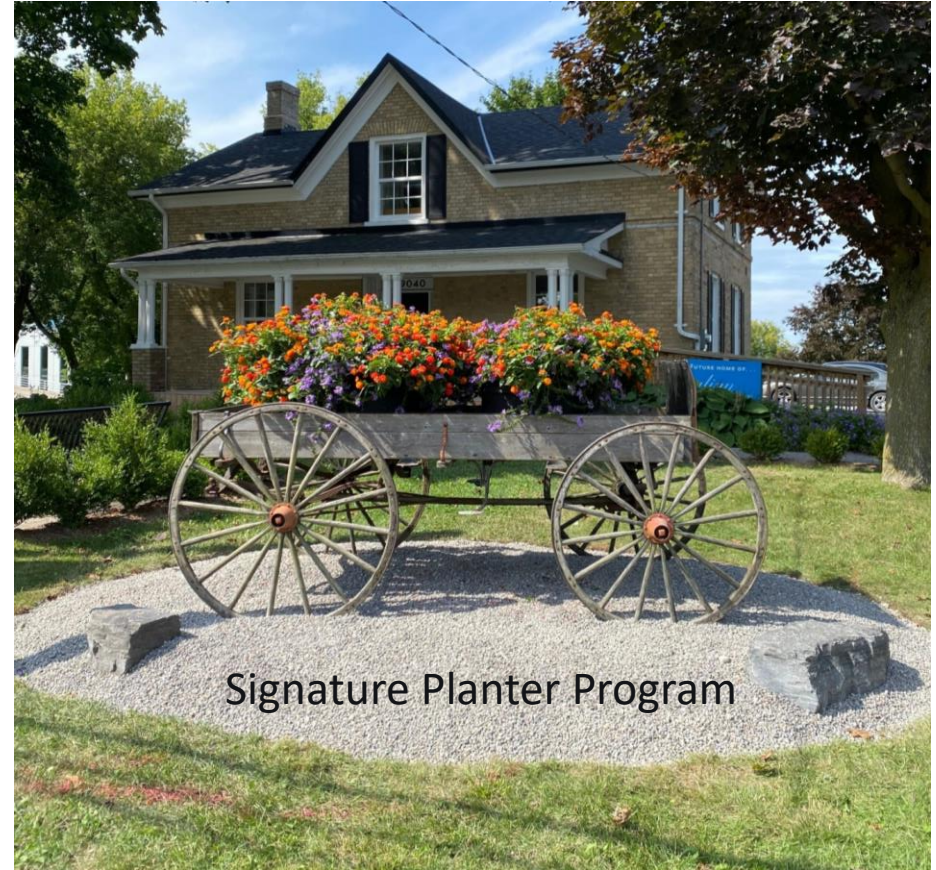
Signature Planter Program