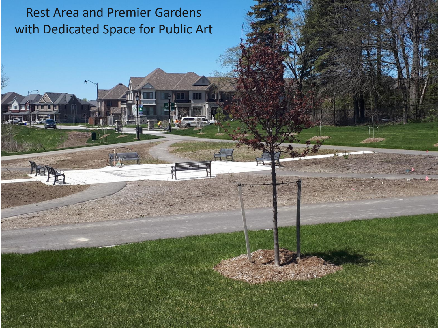
Rest Area and Premier Gardens with Dedicated Space for Public Art