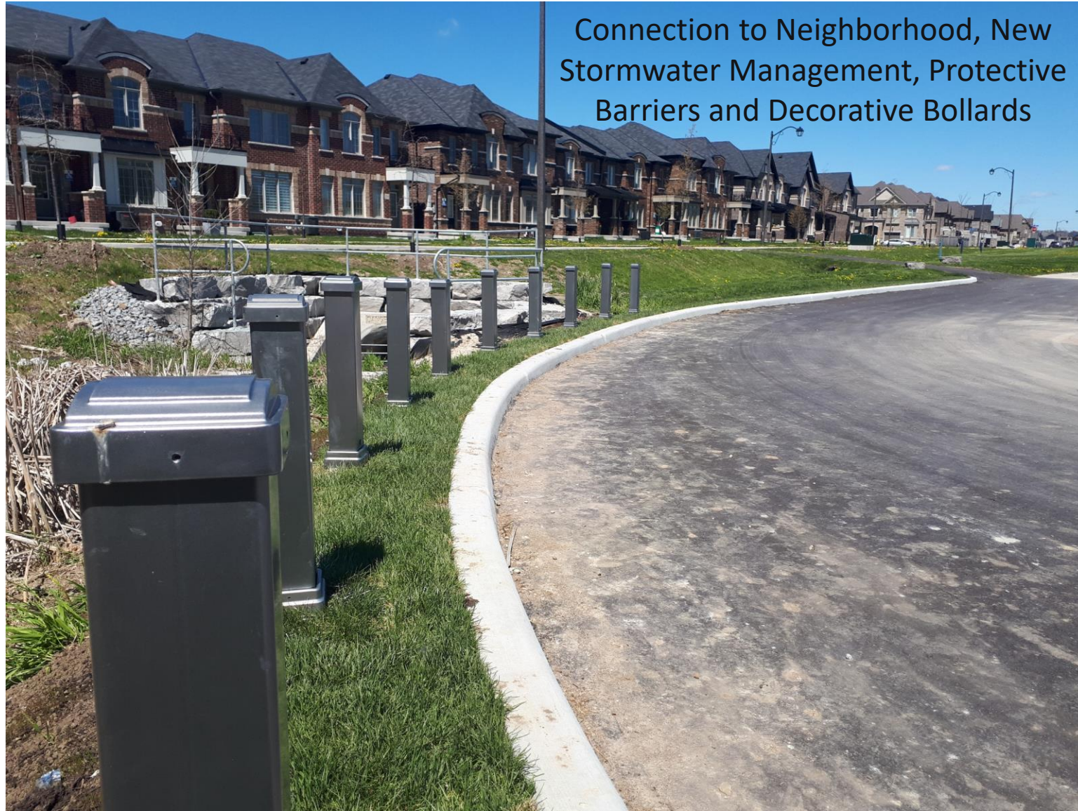
Connection to Neighborhood, New Stormwater Management, Protective Barriers and Decorative Bollards