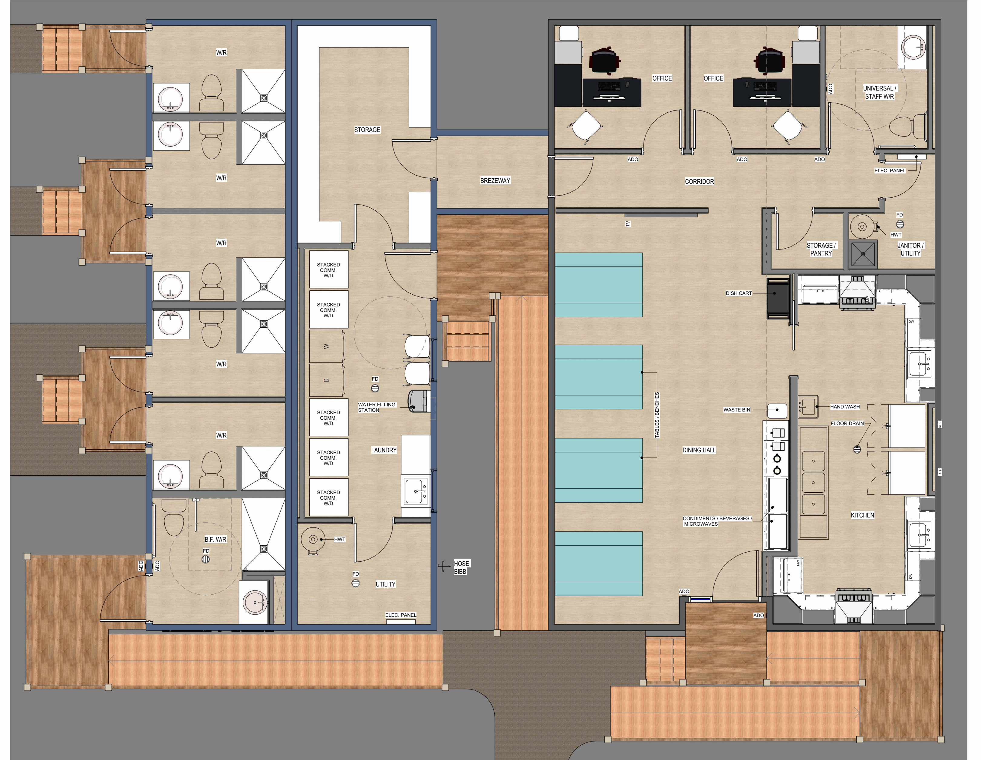
1 FLOOR PLAN - COMMON BUILDING Scale = 1/4" = 1'-0"