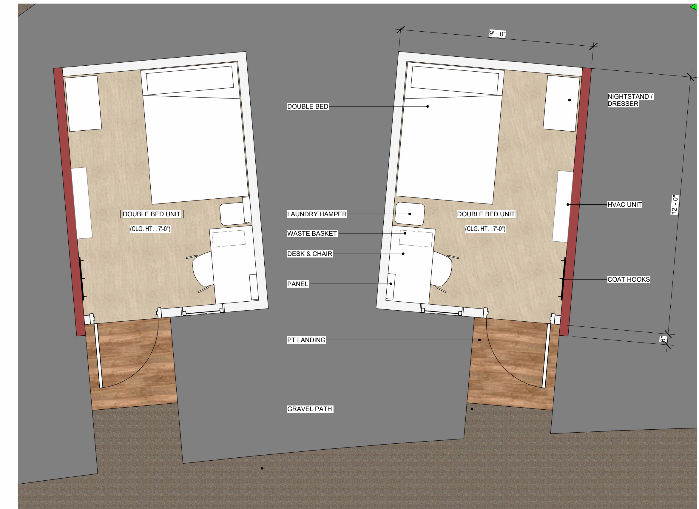
2 Double Bed Units Scale = 3/8" = 1'-0"